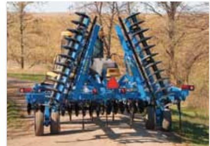
2211-13 & 15 Shank Models feature folding rear gangs for reduced transport width. Transport Height on 13 & 15 Shank Folding Models: 13'-4" & 14'-0"