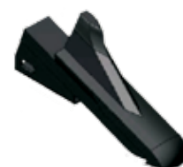
SHARK FIN POINT