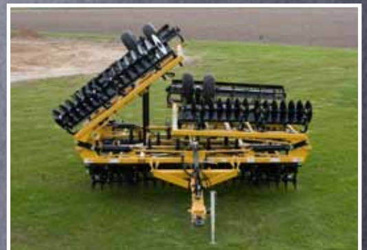
The 35' & 40' Tilloll has a stack fold system with a transport height of 13'-0" (35') and 13'-9" (40') and transport width of 17'-9".