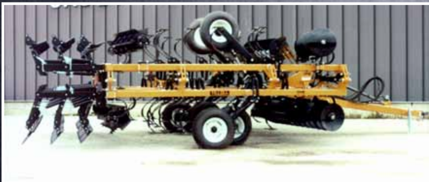
Wing Models from 18' to 30' fold flat for easy storage.