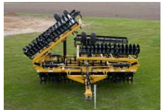
The 35' & 40' Tilloll has a stack fold system with a transport height of 13'-0" (35') and 13'-9" (40') and transport width of 17'-9".