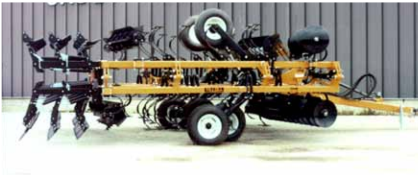
Wing Models from 18' to 30' fold flat for easy storage.