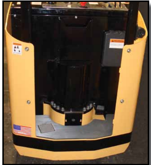
Low Step Height Operator Rear Entry