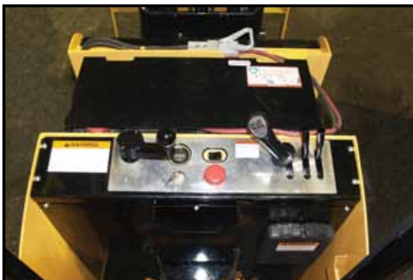
Ergonomic Operator Control Console