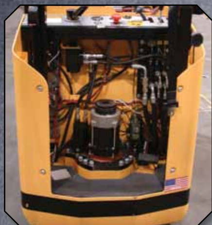
Rear Cover Removed

Landoll LSC's simplicity and designed in maintainability make the cost of ownership much lower than comparable forklifts. A front cover provides easy access to the hydraulic tank and dipstick, and the modular hydraulic motor/pump assembly. A rear cover provides access to the drive system, including AC traction and hydraulic controls, fuses and all major components including the hydraulic valve, master cylinder and electric brake.