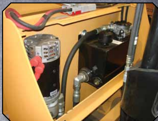
Front Cover Removed