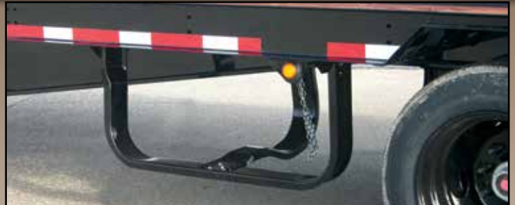
Spare Tire Carrier