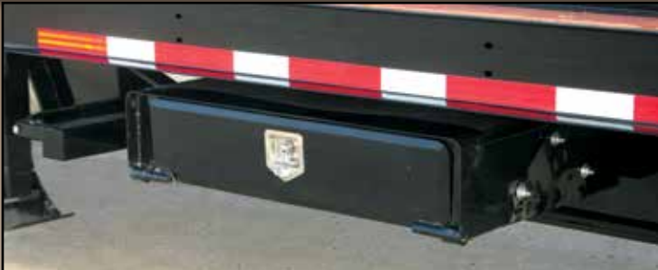
Under Deck Mount Toolbox